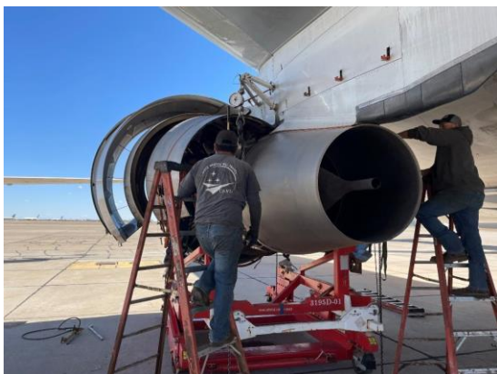
Existing customers are expanding their operations at CAVU Aerospace in Roswell.