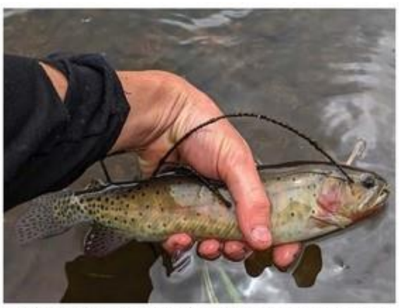
If you plan on releasing a fish, do not hold it by the gills.