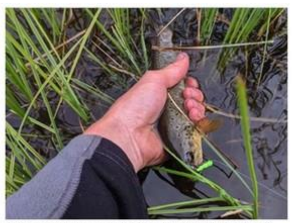
Fish need water to breathe, regulate temperature and maintain the protective slime on their skin.

Fish need water to breathe, regulate temperature and maintain the protective slime on their skin. Primarily, keeping the fish in the water will allow it to continue to breathe as you take a picture and remove the hook. But, keeping the fish in the water is important for other reasons. If you land a fish by dragging it onto the bank, the protective slime on its skin will be damaged and leave the fish susceptible to die of infection soon after you put it back. Also, even a brief exposure to outside air temperatures on a hot summer day can be enough to raise a fish's body temperature to