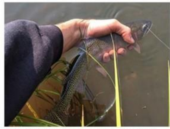
When you are putting a fish back in the water, it may need to catch its breath after the fight before it is able to swim away.

Share your tips and tricks by emailing us at <a href="mailto:funfishingnm@gmail.com">funfishingnm@gmail.com</a> and let us help the next generation of anglers find success.