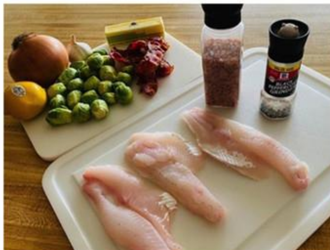
Prepare the ingredients.

Make the brussels sprouts salad first and get it cooking. Cook the walleye fillets after the brussels sprouts salad has been cooking for about six minutes. This way everything will finish at the same time and can be served hot.