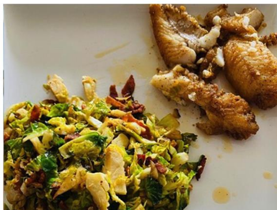
Finished walleye and salad.