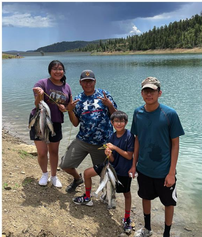
The Riley family of Laguna Pueblo each caught their limit of trout using green PowerBait and Pistol Pete spinner flies at Grindstone Reservoir.

Corona Pond: Fishing for catfish was fair when using nightcrawlers and raw chicken.