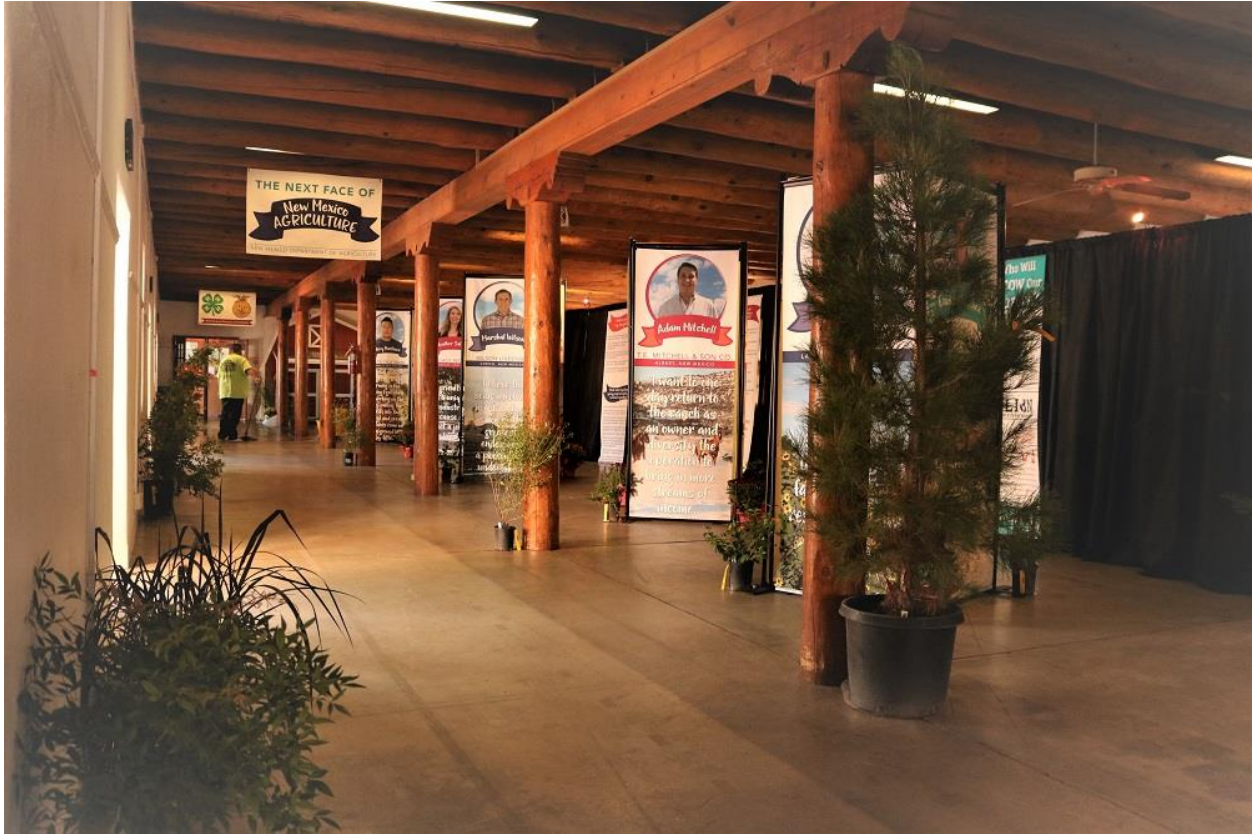
Cutline: The New Mexico Department of Agriculture seeks photos from the state’s agriculture industry for its “NM Ag Never Stops” display at the 2021 New Mexico State Fair in Albuquerque in September. The theme of the 2016 display was “The Next Face of New Mexico Agriculture.”