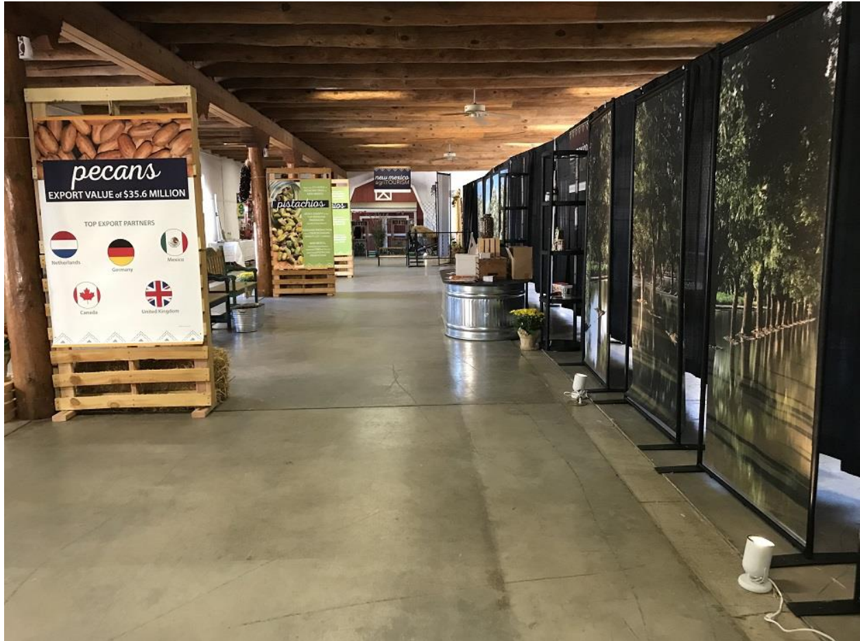
Cutline: The New Mexico Department of Agriculture seeks photos from the state's agriculture industry for its "NM Ag Never Stops" display at the 2021 New Mexico State Fair in Albuquerque in September. The 2019 display featured New Mexico export products.