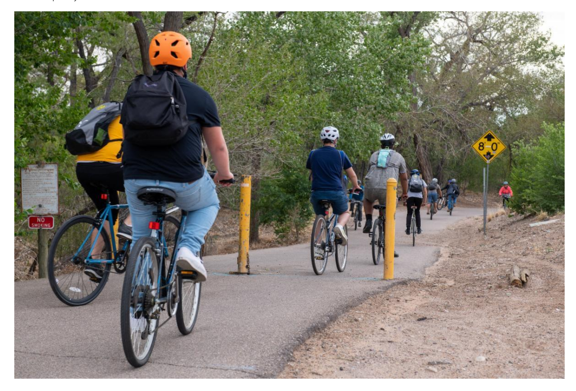
2020 & 2021 OEF recipient Together for Brothers biking in the bosque.