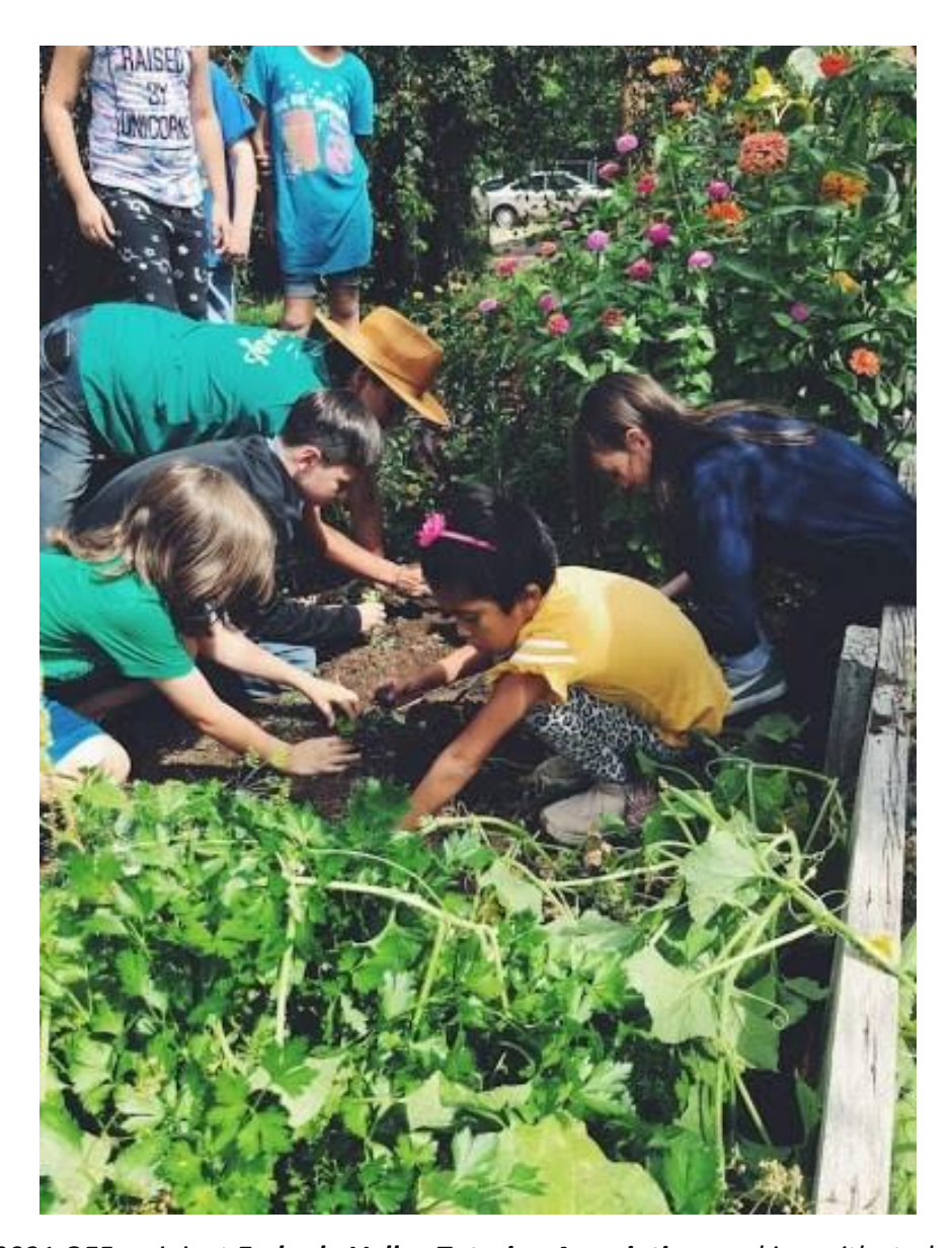
2020 & 2021 OEF recipient Embudo Valley Tutoring Association working with students in the community garden.