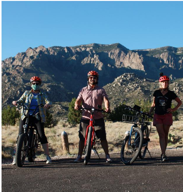
Free-to-Roam Ebiking lead team