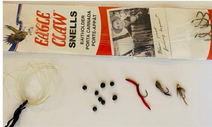
Twelve feet of 6-pound test fishing line, split-shot weights in assorted sizes, No. 8 Eagle Claw bait hooks, San Juan Worm fly, golden hare's ear nymph fly, beadhead golden hare's ear nymph fly.

After driving past several small streams, I realized I should have brought just a small bag of fishing gear. A couple of fresh trout to go with the antelope meat would have made for some fine "surf and turf." So, this week's Tips and Tricks is the pill jar of essential fishing gear that I put together for my next hunting trip.