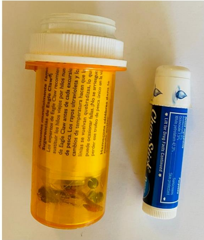
Everything fits into a small pill jar that is just a little bigger than a normal ChapStick.

Share your tips and tricks with your fellow anglers by emailing us at funfishingnm@gmail.com and let's help the next generation of anglers find success.