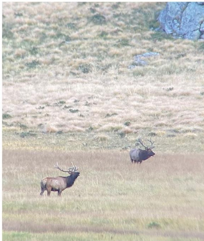
Two Valles Caldera bull elk bugle back and forth at each other during their annual mating competition.

Share your tips and tricks with your fellow anglers by emailing us at funfishingnm@gmail.com and let's help the next generation of anglers find success.