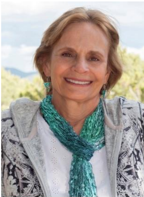
Cutline: Author Anne Hillerman is a 2021 Rounders Award recipient. The Rounders Award, named after the classic Western novel written by Max Evans, serves to honor those who live, promote and articulate the western way of life.