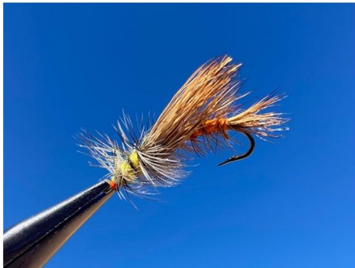
A stimulator dry fly with a smashed-down barb.

A barbless hook will help you remove the hook from the fish with greater ease and much less damage than a barbed one. It will also be a heck of a lot safer for you, in the event you accidentally snag yourself. (It happens to the best of us!)