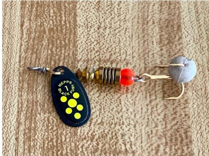
Mepps spinner tipped with a white PowerBait Power Egg.

Let us know how your fishing trip goes! Share your tips and tricks with your fellow anglers by emailing us at funfishingnm@gmail.com and let's help the next generation of anglers find success.