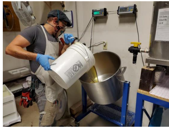
Los Poblanos Historic Inn and Organic Farm