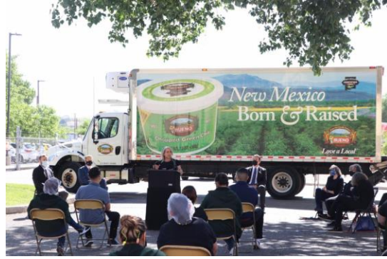
Gov. Lujan Grisham at the Bueno Foods