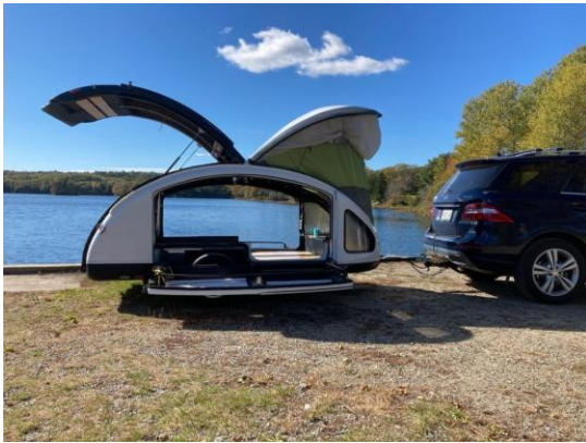
Earth Traveler Teardrop Trailers LLC