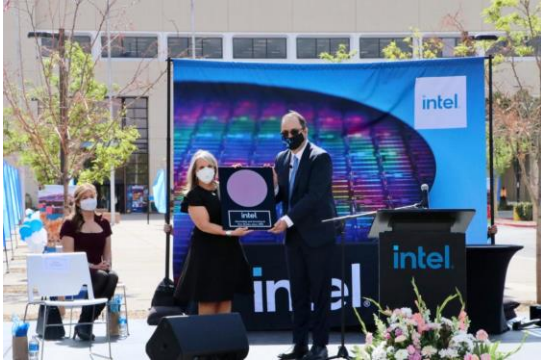
Gov. Lujan Grisham at the INTEL expansion announcement