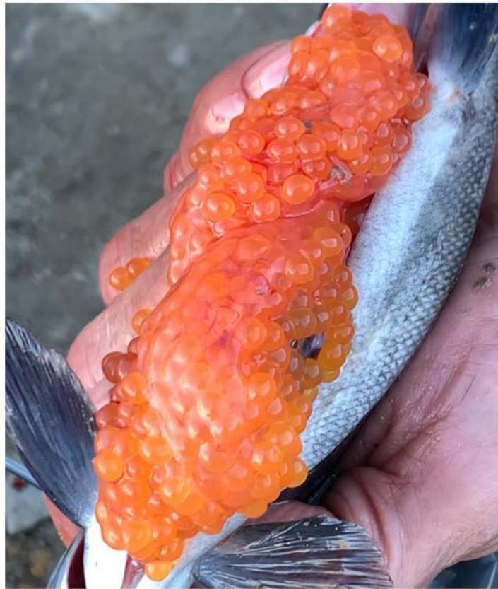
Opening the female salmon.

or plastic bag. Once you get home, make a filtered water and non-iodized salt bath to prevent eggs from turning white. Use your hands to rinse the eggs in this solution. After a minute, drain the salt water and rinse eggs in clean, cold, filtered water. Next, store in small baby food jars filled with eggs, cover and freeze. Eggs are good for two years!