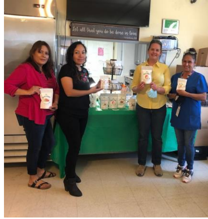
Backyard Farms LLC