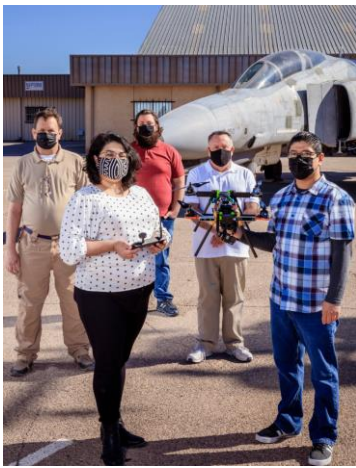
Emerging Technology Ventures, Inc.