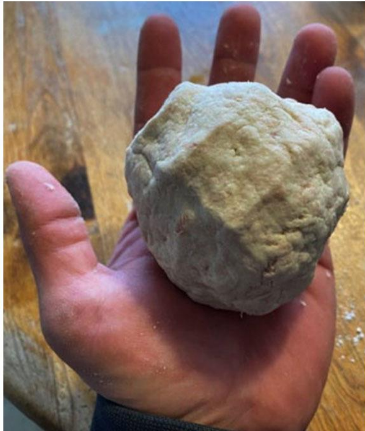
This dough ball was made using 1/2 can of tuna, including half the water in the can; 1 teaspoon of garlic salt and 3/4 cup of Bisquick.