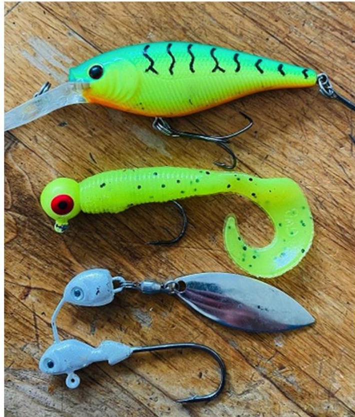
Firetiger colored crank baits (top), 3-inch chartreuse curly tail grubs (middle) and blade baits (bottom) are good lures for catching walleye.

Let us know how your fishing trip goes! Share your tips and tricks with your fellow anglers by emailing us at funfishingnm@gmail.com and let's help the next generation of anglers find success.