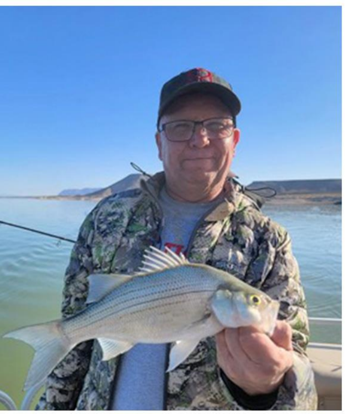
White bass have faint dark horizontal lines that are not continuous from head to tail.

Thanks for reading and supporting our angling community!