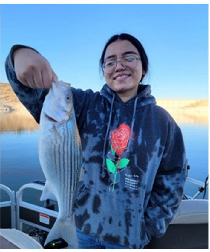
Stripers have solid dark horizontal lines all the way to their tails. Juvenile stripers have a more slender shape than white bass.

Juvenile stripers have a slenderer shape in comparison to common white bass. Stripers have solid dark horizontal lines all the way to their tails, while white bass have some faint dark lines that are not continuous from head to tail.