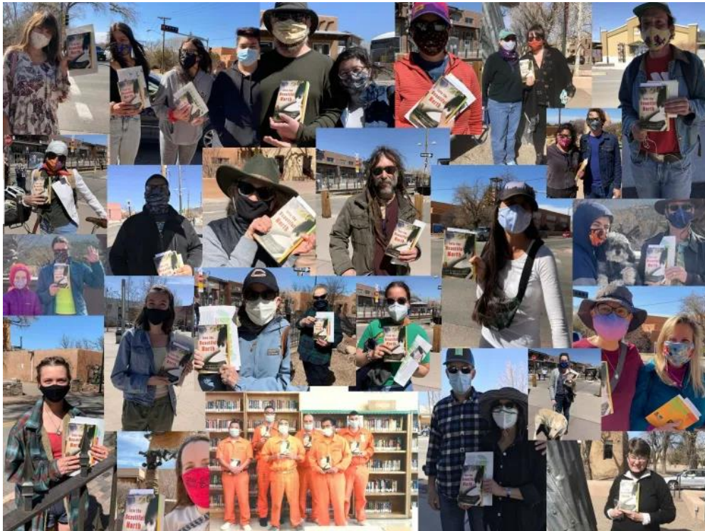
Above: Participants in the SFPL's 2021 Big Read hold their copies of "Into the Beautiful North" by Luis Alberto Urrea

Stay tuned for announcements about the SFPL's Big Read programming and offerings later this year!