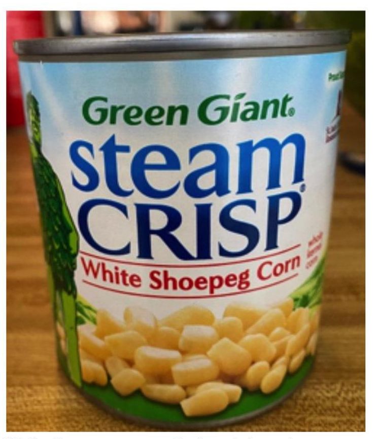
White shoepeg corn can be found at most grocery stores and works well on a spinner's hook when fishing for kokanee salmon.

Let us know how your fishing trip goes! Share your tips and tricks with your fellow anglers by emailing us at <u>funfishingnm@gmail.com</u> and let's help the next generation of anglers find success.