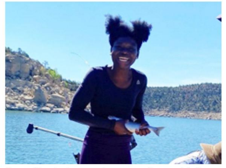
Rose with a kokanee salmon recently caught at Eagle Nest Lake using a pink spinner tipped with corn.