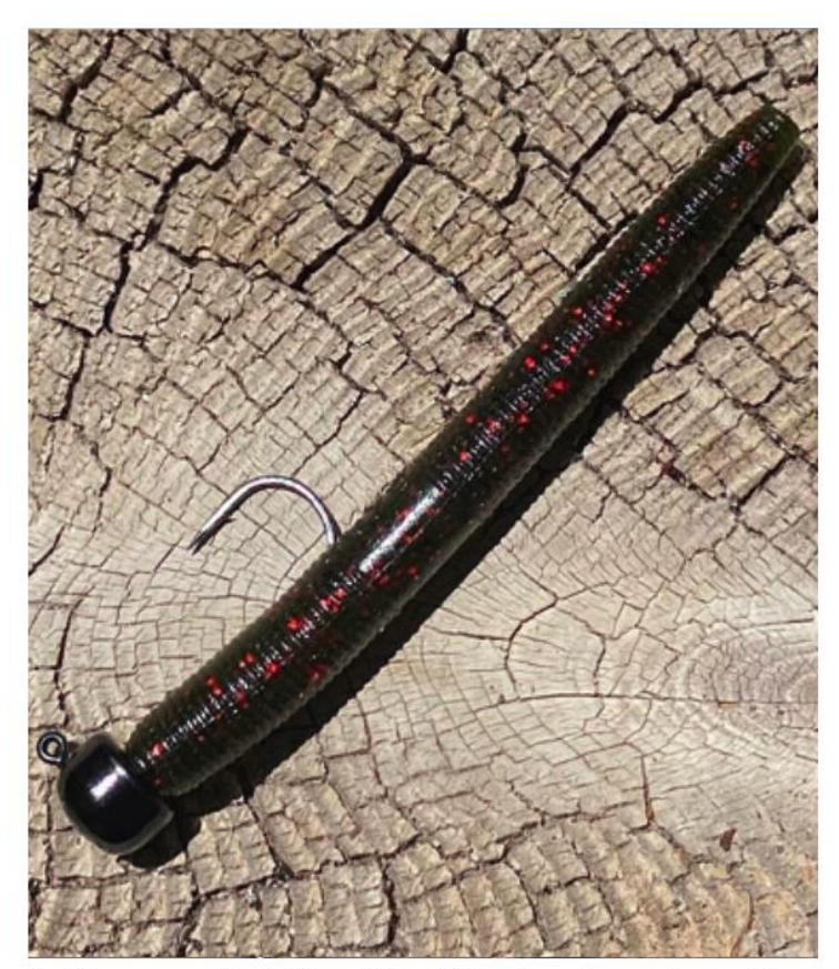
A 1/4-ounce Ned Rig with a 3-inch watermelon-withred-flake plastic worm.

This time of year, the weather is warm, and anglers and fish alike appreciate a nice spot where they can keep cool during the daytime hours. For bass, this means they are seeking out deeper water often located on main lake points where the water is cooler. Little bass might still hang around the shoreline, but bigger bass are typically in deeper water, aside from the early-morning and lateevening hours.