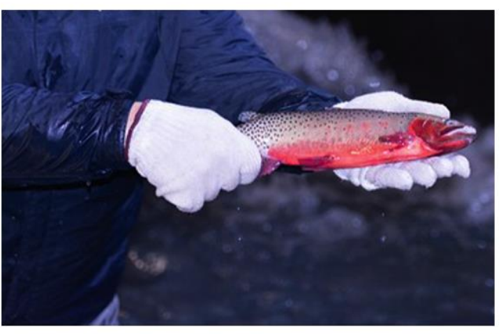
Department of Game and Fish staff continue efforts to rescue Rio Grande cutthroat trout from post-wildfire ash flows and relocate the native fish to streams throughout northeastern New Mexico this week.

Clayton Lake: Fishing for catfish was fair to good when using chicken liver and homemade dough baits.