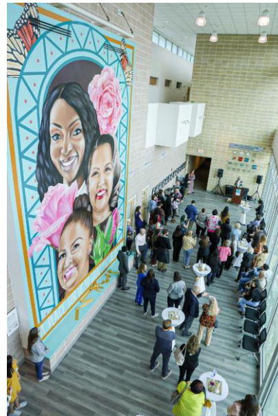
Mural reveal at WESST