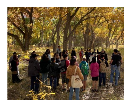
Outdoor Equity Fund awardee Bosque Ecosystem Monitoring Program youth outdoors for education programming.

The mission of the Outdoor Recreation Division, a division of the New Mexico Economic Development Department, is to increase equitable access to the outdoors for all New Mexicans, ensuring healthy outcomes, environmental stewardship, and economic prosperity.