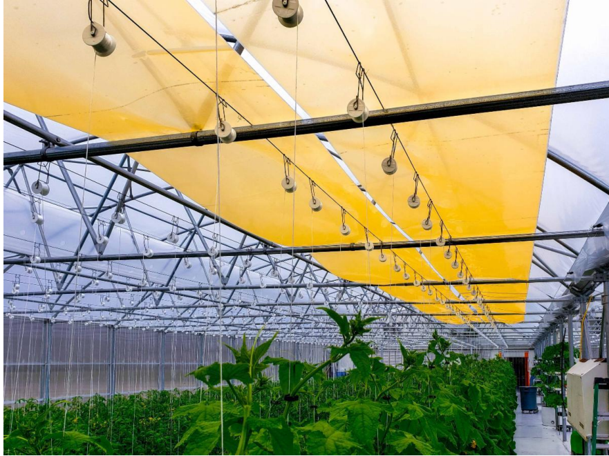
UbiGro inside a greenhouse.

Mesa Photonics has created a ground-based remote sensor for measuring variations in humidity from the ground up to altitudes as high as 50,000 feet, used to improve weather forecasting and for better understanding climate. Mesa Photonics sensors can be set up anywhere. Humidity is measured using laser technology to observe extremely small changes in sunlight intensity. The laser light is fully contained within the sensor and, therefore, is completely safe.