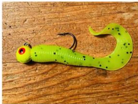
Curly tail grub.