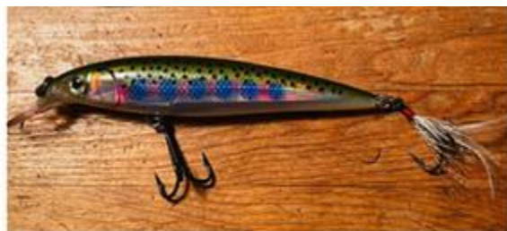
Rapala rainbow trout pattern jerkbait. Other popular color patters for walleye include white, chartreuse, silver, grey and combination patterns.