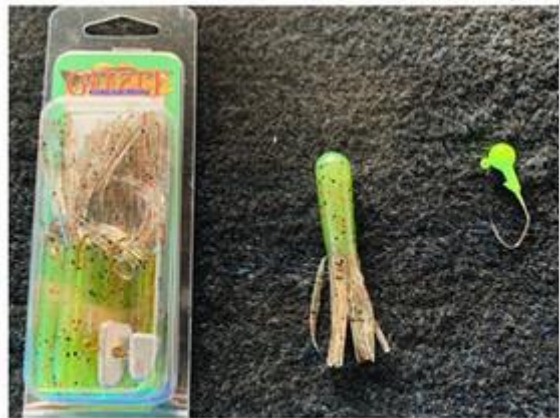
Glitz tubes with 1/8-ounce chartreuse jig heads.

Justin likes to use watermelon smoke Gitzit tubes. The pack of tubes comes with lead jig heads designed to be used with the tubes. Instead, Justin uses round 1/8-ounce chartreuse jig heads. The tubes are a bit translucent, so when the round chartreuse jig head is inserted into the tube you can see the jig head through the tube. The smallmouth bass seem to like this slight color change and gobble these tubes up at Navajo Lake.