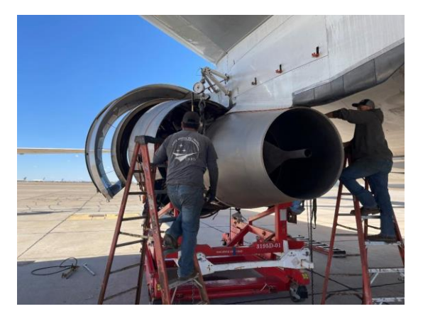
Existing customers are expanding their operations at CAVU Aerospace in Roswell.

Vitality Works, Inc. , Albuquerque, 14 trainees. Vitality Works is a homegrown New Mexico company that provides leading edge medicinal supplements. The company sells product to healthcare practitioners, health food stores, retail stores, natural food traders, multi-level marketing companies, and foreign operations. Average trainee salary: $24.234; Total funding: $150,812.88.