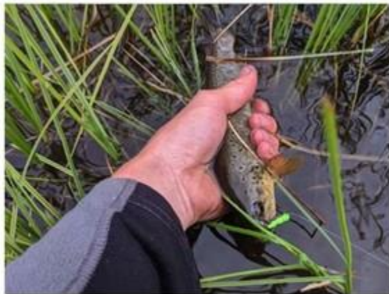
Fish need water to breathe, regulate temperature and maintain the protective slime on their skin.

Fish need water to breathe, regulate temperature and maintain the protective slime on their skin. Primarily, keeping the fish in the water will allow it to continue to breathe as you take a picture and remove the hook. But, keeping the fish in the water is important for other reasons. If you land a fish by dragging it onto the bank, the protective slime on its skin will be damaged and leave the fish susceptible to die of infection soon after you put it back. Also, even a brief exposure to outside air temperatures on a hot summer day can be enough to raise a fish's body temperature to fatal levels and kill it soon after it is released. A net can be beneficial for keeping the fish in the water; just make sure it is a plastic mesh net rather than a rope net which will damage fish scales.