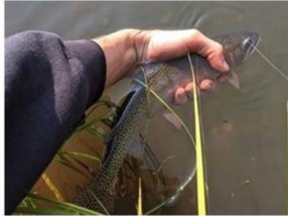
When you are putting a fish back in the water, it may need to catch its breath after the fight before it is able to swim away.

When you are putting a fish back in the water, it may need to catch its breath after the fight before it is able to swim away. By holding it in the water and gently moving it forward, you move water through its gills which allows it to catch its breath. Usually, a fish will only need to be held for a few seconds before it regains the oxygen necessary to swim away on its own. Fish that haven't been allowed to catch their breath generally can't fight the current of a river and risk being swept down and battered in the current.