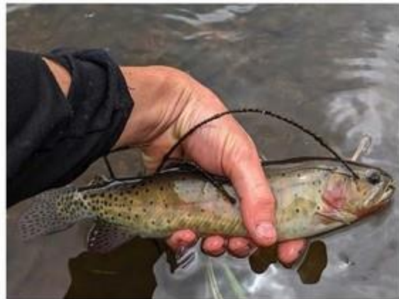
If you plan on releasing a fish, do not hold it by the gills.

If you plan on releasing a fish, do not hold it by the gills. A fish's gills are fragile, just like our lungs. Touching the gills or holding a fish by its gills can damage them to the point where the fish will slowly suffocate and die soon after it is released. If you plan to release a fish, hold it by its body or its jaw.