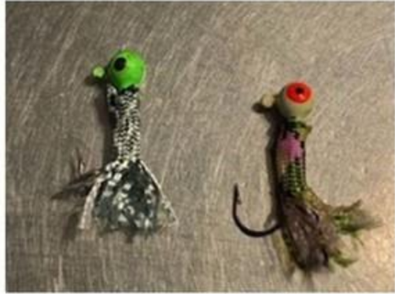
Finished homemade paracord crappie jigs.

Thanks for reading and supporting our angling community!