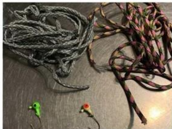
1/8-ounce jig heads and size 1/4 paracord.