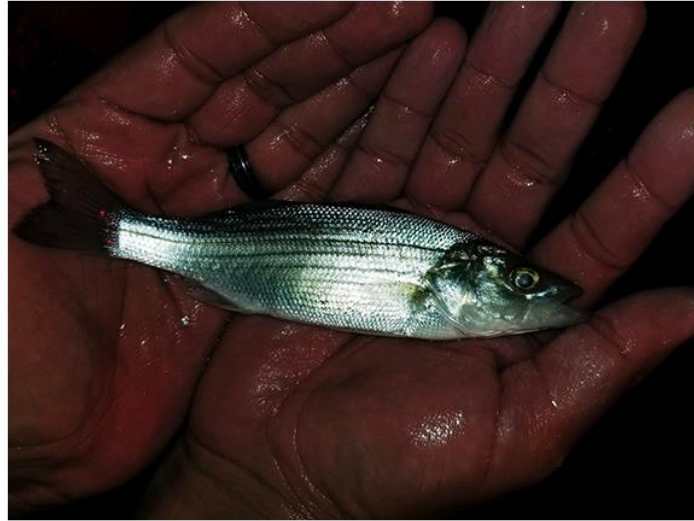
Fingerling striped bass.

for to determine if your catch is a striper or white bass: juvenile stripers are slenderer in shape compared to white bass, stripers have solid, darker horizontal lines on their tails in comparison to white bass and stripers have two parallel tooth patches on the back of the tongue whereas white bass only have one. If you are catching a lot of white bass and happen to catch a funny, skinny, darker-lined one, consider letting it go because there is a good chance it is a baby striper.