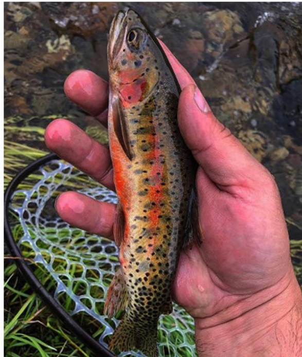
Rio Grande cutthroat trout.

Thanks for reading and supporting our angling community!