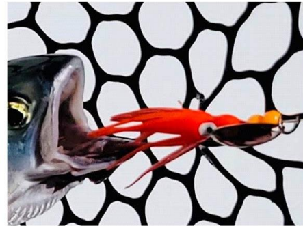
An orange Hoochie Squid. Remember to put one to three kernels of white Shoepeg corn on each hook.

Share your tips and tricks with your fellow anglers by emailing us at funfishingnm@gmail.com and let's help the next generation of anglers find success.