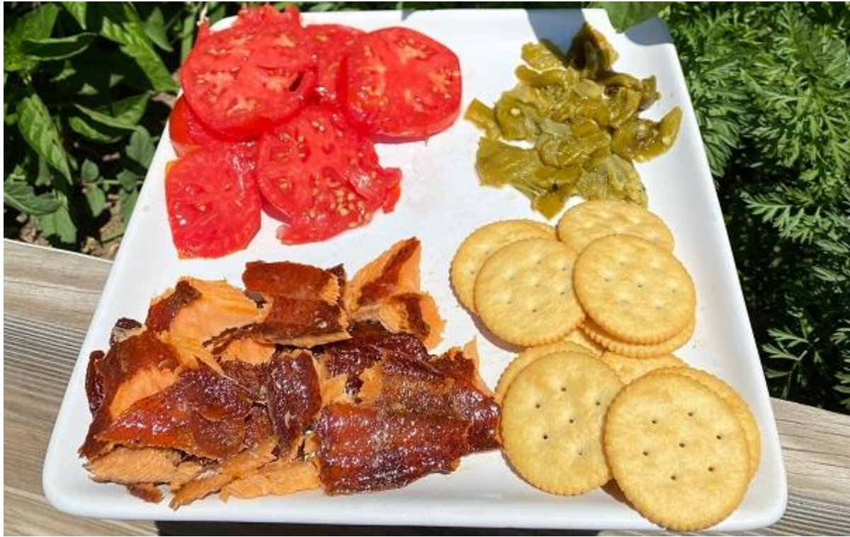
I cut the salmon, chile and tomato into bite-size pieces about the size of a Ritz cracker.