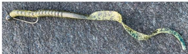
Green plastic worm rigged on a shaky head jig.