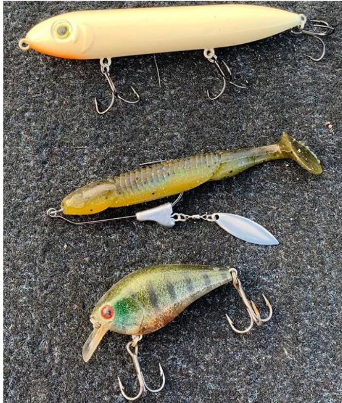
(Top to Bottom) Blue's Baits Top Water Spook, underspin bluegill swim bait, perch pattern shallow diving crankbait.

Thanks for reading and supporting our angling community!