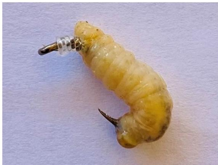
A wax worm threaded onto a #8 Eagle Claw hook. This is a good way to hide the hook from the fish.

Share your tips and tricks with your fellow anglers by emailing us at funfishingnm@gmail.com and let's help the next generation of anglers find success.