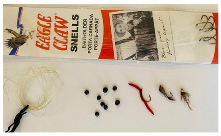
Twelve feet of 6-pound test fishing line, split-shot weights in assorted sizes, No. 8 Eagle Claw bait hooks, San Juan Worm fly, golden hare's ear nymph fly, beadhead golden hare's ear nymph fly.

We left town with only essential camping gear and some antelope meat from a recent harvest that we planned to cook over the campfire. In my opinion, camp food cooked over an open fire is some of the best!