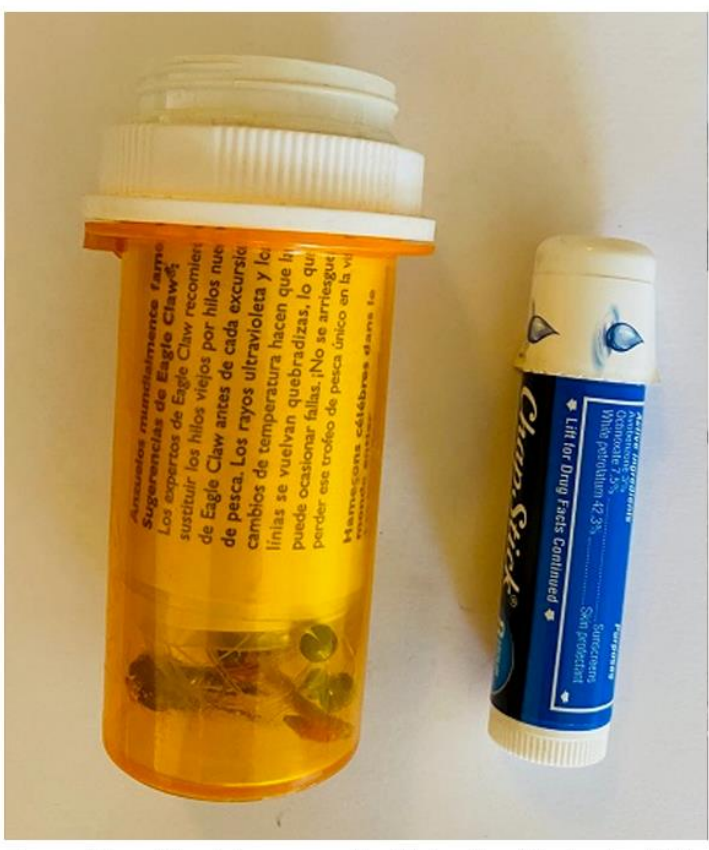
Everything fits into a small pill jar that is just a little bigger than a normal ChapStick.

Give it a try. This bag of fishing gear fits nicely in the bottom of your hunting pack. Even the smallest mountain streams can hold some tasty trout that add a nice variety to your hunting table fare.