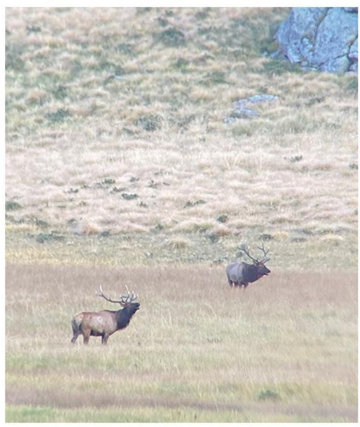
Two Valles Caldera bull elk bugle back and forth at each other during their annual mating competition.

Share your tips and tricks with your fellow anglers by emailing us at <a href="mailto:funfishingnm@gmail.com">funfishingnm@gmail.com</a> and let's help the next generation of anglers find success.