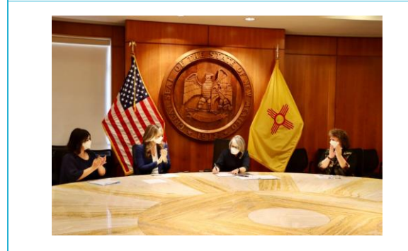
Gov. Lujan Grisham signs an Executive Order on Regulatory Reform