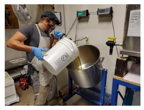
Los Poblanos Historic Inn and Organic Farm