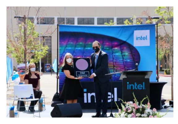
Gov. Lujan Grisham at the INTEL expansion announcement