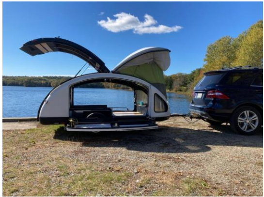
Earth Traveler Teardrop Trailers LLC

To read all of the announcements from EDD, visit the website.