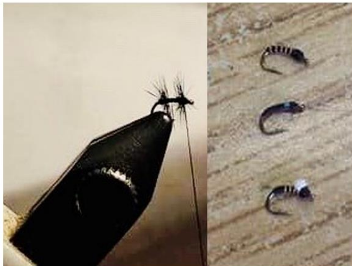
Midge dry fly pattern (left). Midge larvae and emerger pattern flies (right).

Thanks for reading and supporting our angling community!