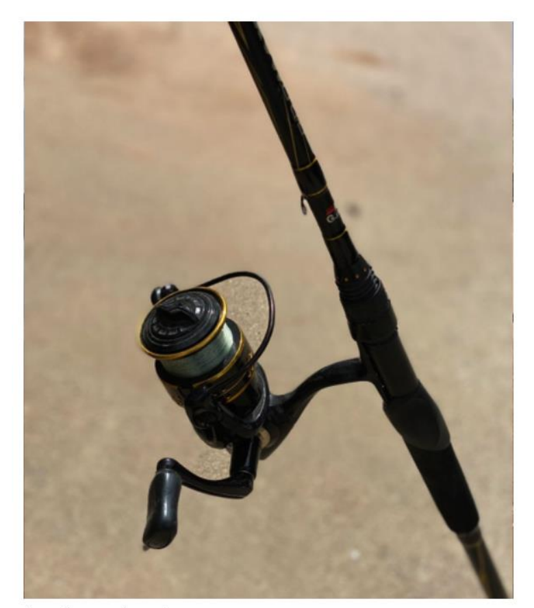
A spin cast reel.