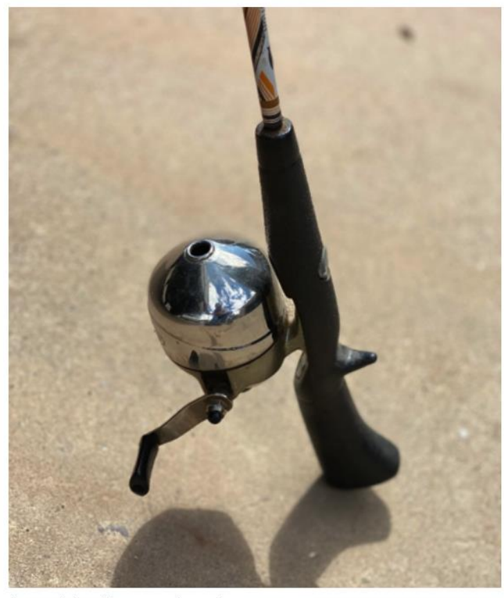
A pushbutton cast reel.

This Saturday is Free Fishing Day and an excellent opportunity to take someone new fishing. Learn more about Free Fishing Day here.