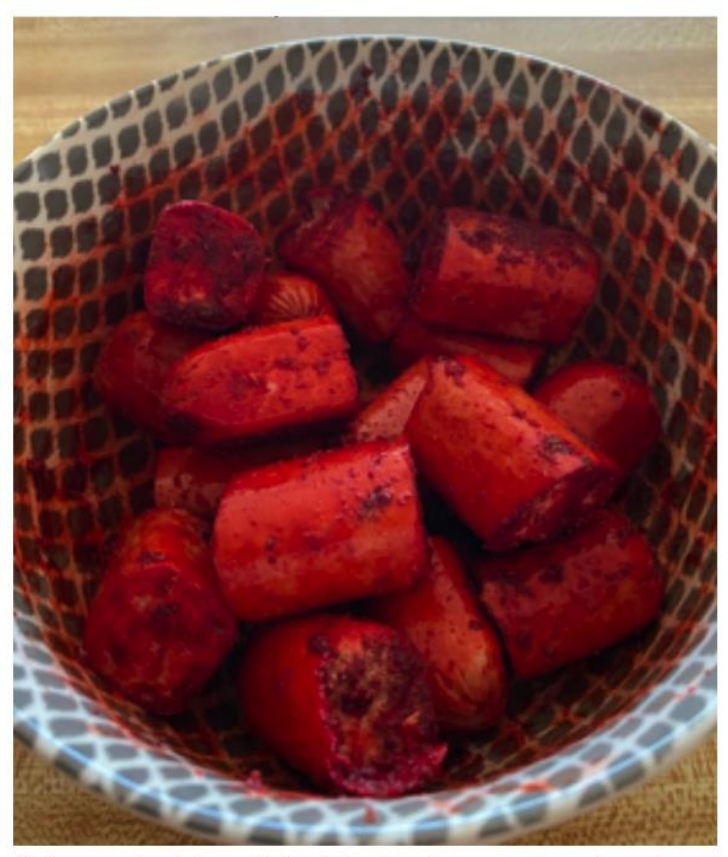
Cut your hotdogs into 1-inch pieces, place in a bowl and sprinkle with strawberry or cherry Kool-Aid mix and garlic powder.