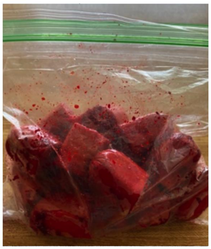
Place the hotdog pieces into a Ziploc bag and allow them to marinate for at least a few hours.