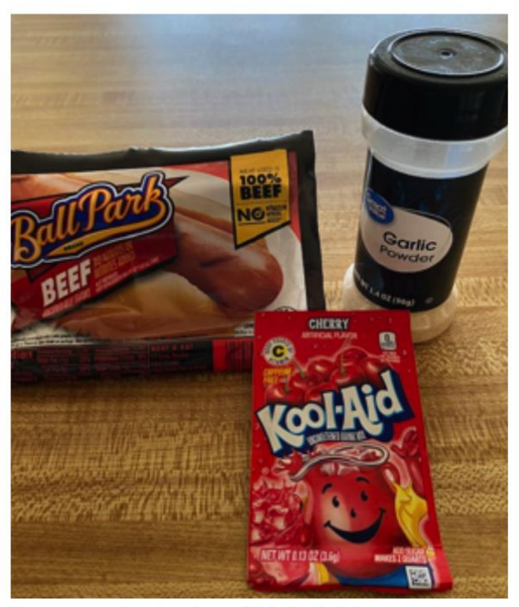
You can make simple catfish bait at home using hotdogs, Kool-Aid and garlic powder.

Let us know how your fishing trip goes! Share your tips and tricks with your fellow anglers by emailing us at <a href="mailto:funfishingnm@gmail.com">funfishingnm@gmail.com</a> and let's help the next generation of anglers find success.