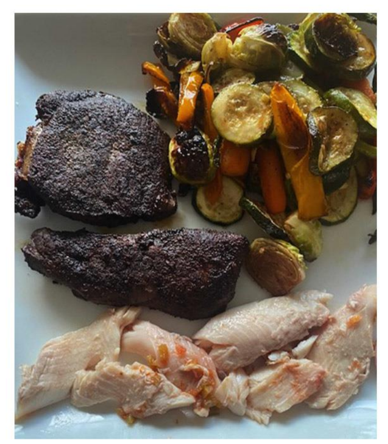
Trout and elk dinner with a vegetable medley.