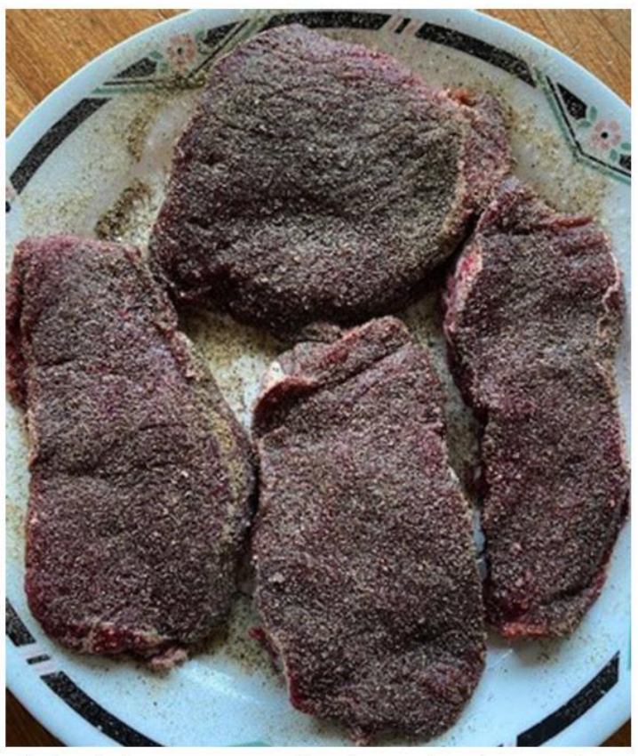
Elk backstraps seasoned and warming to room temperature.

backstraps and the cook's desired level of cooking.