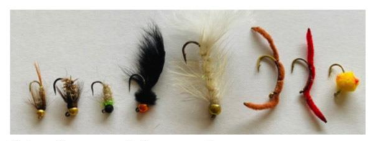
Subsurface nymph fly examples.

The rain knocks flying insects out of the air and off the brush along the edge of the river. It can also initiate certain species of insects to hatch in large numbers, sending trout into a feeding frenzy. Large dry flies such as beetle, cricket, ant, stonefly and grasshopper flies