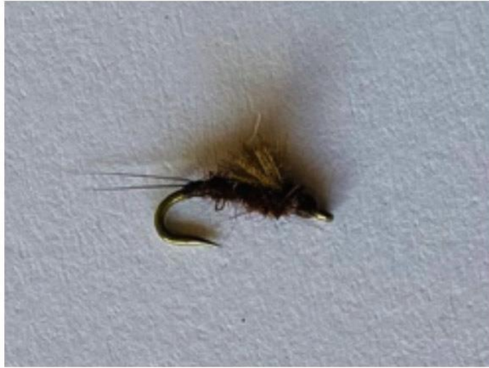
The size 24 root beer-colored midge fly that out-fished all other flies during a June 30 fishing trip on the San Juan River.

Figuring out exactly what bug they were eating was the tricky part. We forged further downriver to avoid the crowds and find a quieter place to hone our craft.