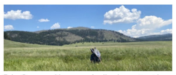
Tyler Berg sneaking up on feeding brown trout in a small stream bordered by tall grass in the Jemez Mountains.

We fished with medium-to-large foam hopper imitations and stimulator dry flies. The best fly colors for us were orange, yellow,