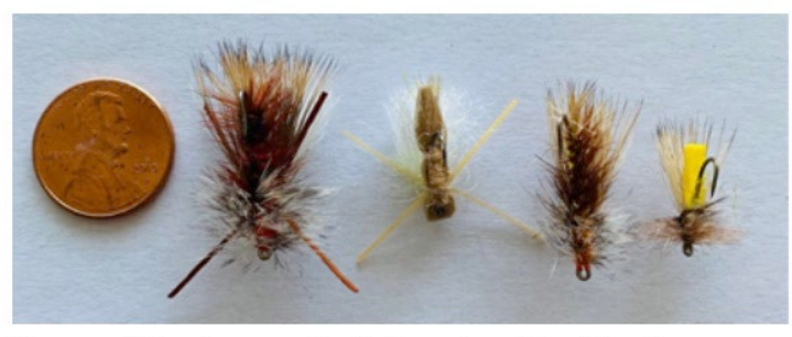
Some of the hopper imitation dry flies the Bergs used to when they fly fished in the Jemez Mountains July 15.

It is a glorious time of year when the grasshoppers are abundant and dry fly fishing with big, leggy hopper flies is the norm. This past weekend, we went to the Jemez Mountains to get away from the heat and try our luck fly fishing the small, high mountain streams. Upon arrival we were greeted by thousands of grasshoppers smothering the dirt road headed through the meadow en route to the San Antonio River. I believe the recent monsoon weather was