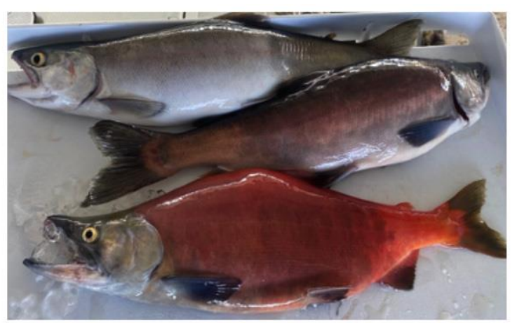
The red kokanee salmon shows the transformation that a male kokanee undergoes during spawning season. In addition to the red coloring, they develop a hooked jaw and humped back.

A popular method for catching kokanee is snagging — the intentional taking of fish by hooking the body rather than the mouth. Kokanee are the only fish in New Mexico that may be legally snagged, and only during the special kokanee snagging season. If another species is caught by snagging, it must be immediately returned to the water.