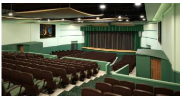
Carlsbad Cavern Theater MCA Design Rendition