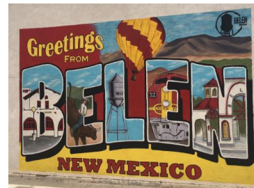
Downtown Belen Mural