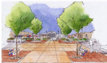
Barelas Great Blocks 4th Street Intersection Concept