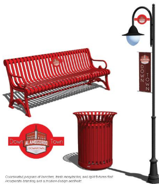
Alamogordo Great Blocks Street Amenities Concept