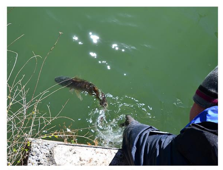
Fishing for walleye was slow when using nightcrawler worms at Elephant Butte Lake this past week.

Elephant Butte Lake: Fishing for catfish was good when using shad and cut bait. Fishing for largemouth