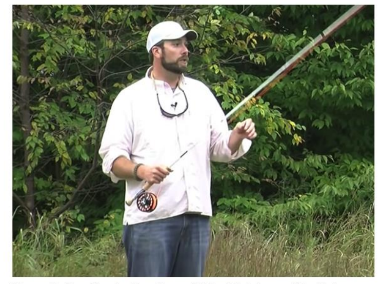
Search for Orvis Basics of Fly Fishing with Pete Kutzer on YouTube to learn more about how to make a basic cast or how to store your fly rod.

Water conditions can help determine the best type of fly to use.