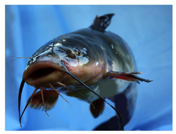
Fishing for catfish has been fair to good when using bluegill cut bait at Santa Rosa Lake over the past week.

Bonito Lake: Closed until further notice by the City of Alamogordo due to fire damage.