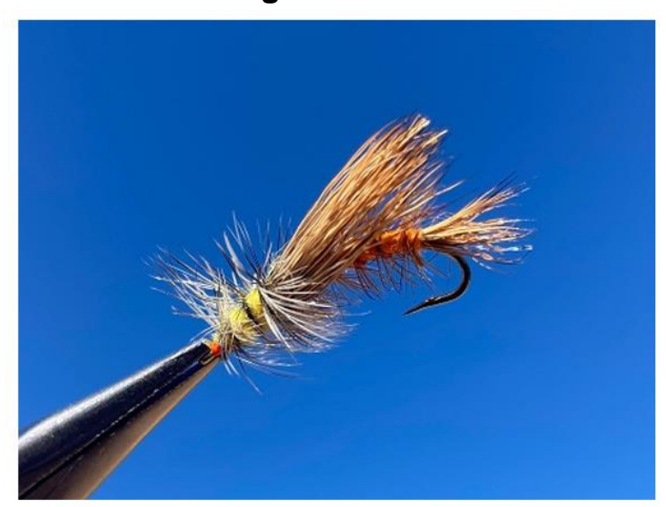
A stimulator dry fly with a smashed-down barb.

A barbless hook will help you remove the hook from the fish with greater ease and much less damage than a barbed one. It will also be a heck of a lot safer for you, in the event you accidentally snag yourself. (It happens to the best of us!)